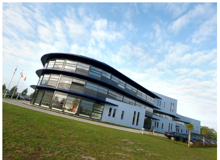
ELECTROMACH factory in Hengelo