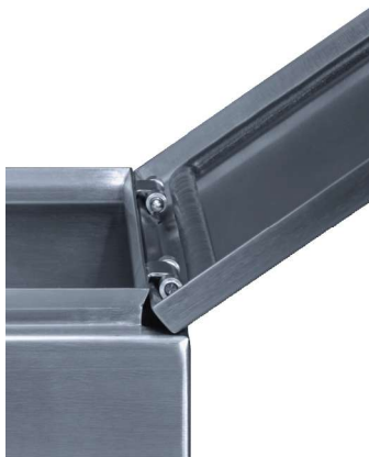
Hinge version with large opening angle 130°