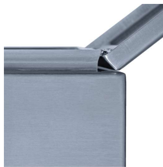
Circumferential protection channel